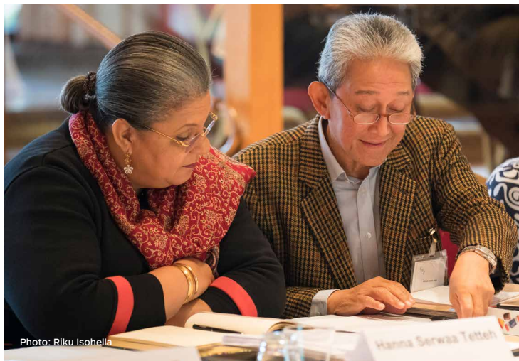
Hanna Tetteh and Rezlan Ishar Jenie in 2019